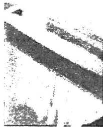
Invest in a shredder

by simply getting hold of personal details from documents such as bank statements, credit card receipts and bills. A common way of gaining this information is through 'bin raiding' the simple act of delving through household waste to find personal documents.